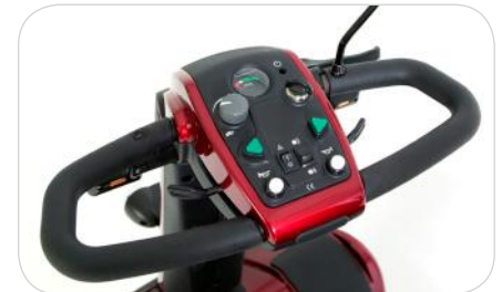
Easy-drive tiller with wraparound handles