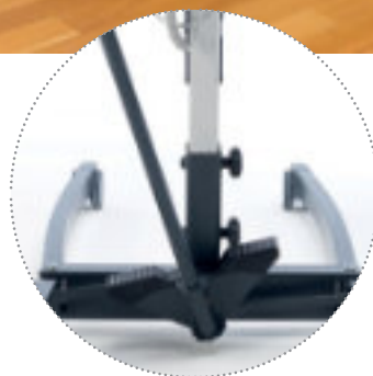
Lever for mechanical leg spread