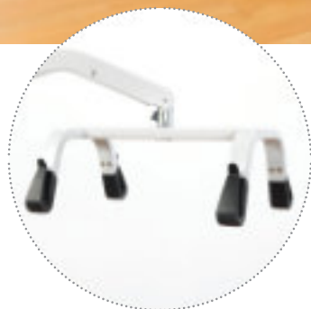
4 point spreader bar