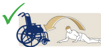
Floor to Bed/Chair