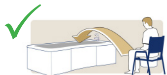
Transfer to Bath