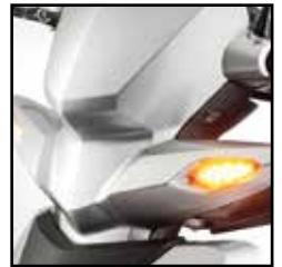
Modern LED lighting system