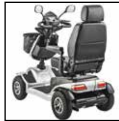
Modern LED lighting system