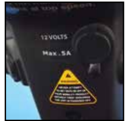
Handy 12 volt socket

Overall Dimension : A x B x C 130 x 69 x 125cm/51 x 27 x 49"