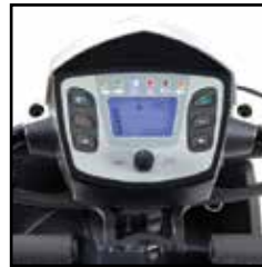
Digital LCD dashboard display