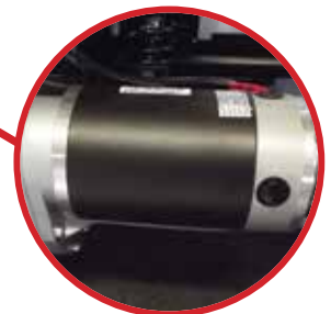
Powerful 4 Pole Motor