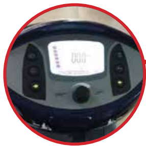
New Anti Glare LCD Screen