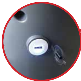
Handy USB fitting