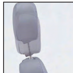
Height adjustable headrest