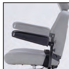
Height adjustable armrest