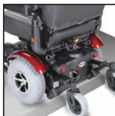
6" caster or front & rear for maximum stability