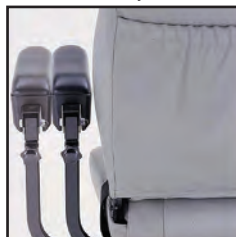
Width adjustable armrest