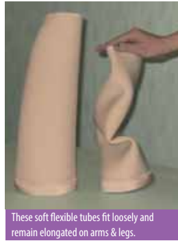
These soft flexible tubes fit loosely and remain elongated on arms & legs.

Two layers of soft, lightweight MicroSpring Textile™ form a loose-fitting tube that stays in place to protect fragile skin from pressure, friction and minor traumas that result in tears, bruising and minor abrasions. Unlike traditional fabric stockings, which are tight and binding, the layers of microfilaments allow air-flow and moisture transfer.